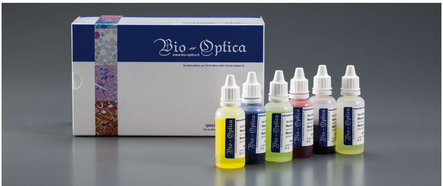
The picture is for illustrative purposes only